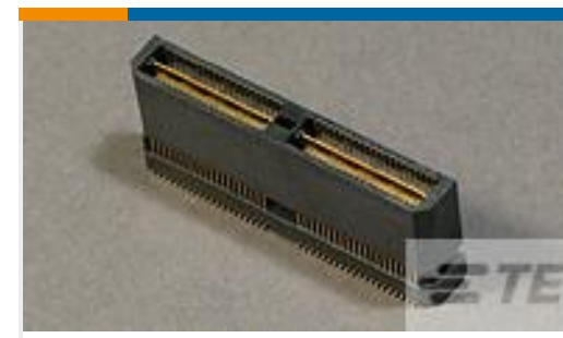
TE Part # 3-1658047-2 MSB0.80PL16ASY56DP,GP,F,VCTY