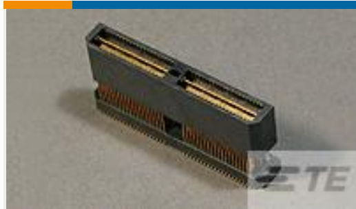
TE Part # 3-1658048-2 MSB0.80PL19ASY56DP,GP,F,VCTY