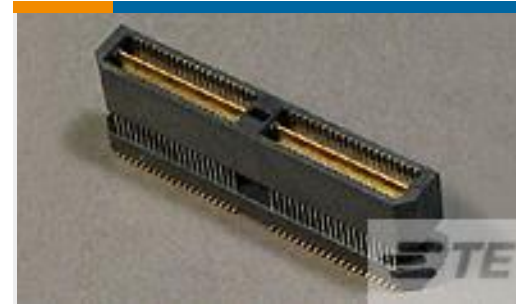
TE Part # 3-1658437-2 MSB0.80PL14ASY56DP,GP,F,VCTY