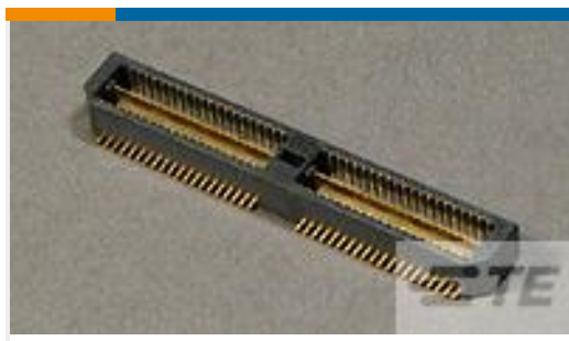
TE Part # 3-1658044-2 MSB0.80PL5ASY56DP,GP,F,VCTY