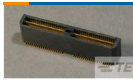
TE Part # 3-1658046-2 MSB0.80PL11ASY56DP,GP,F,VCTY