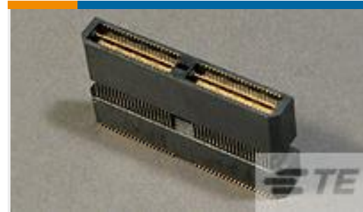
TE Part # 3-1658049-2 MSB0.80PL22ASY56DP,GP,F,VCTY